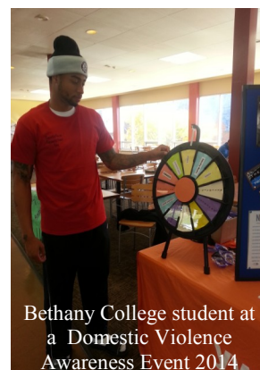
Bethany College student at a Domestic Violence Awareness Event 2014

Visit us on the web!!! www.ywcawheeling.org