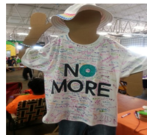
Pictured above: The NO MORE Man, located in the YWCA Lobby, come in and sign to show your support of NO More Domestic Violence and Sexual Assault

There is no excuse for domestic violence.