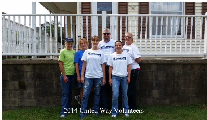
2014 United Way Volunteers

Many thanks to all of our volunteers for contributing their time and talents for making a difference in the lives of others!